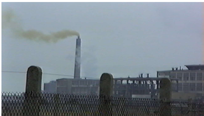
Smoke of unknown composition comes out of a chimney in Bitterfeld, then German Democratic Republic, in 1988.

Data allowing for comparison of mesothelioma incidence trends were obtained from literature [1-4] only for males and without age standardization because of unavailability of age-stratified data. There is still no legal basis for the use of historic individual data in Saxony-Anhalt. The crude incidence rate of mesothelioma for Saxony-Anhalt was 2.4 per 100,000 person-years 1980 to 1989 and 1.7 per 100,000 person-years 2005 to 2014. The counties with highest crude incidence rates 1980 to 1989 were Zeitz and Merseburg with 6.0 and 5.5 per 100,000 person-years, respectively.